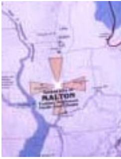
(ABOVE) The Golden City Vortex of "Malton" as it appears on the I AM AMERICA prophecy map. [Malton is located in Illinois and Indiana.]